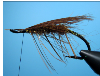
The finished fly

Now you have a fully functional spey fly that can be fished for a variety of species!